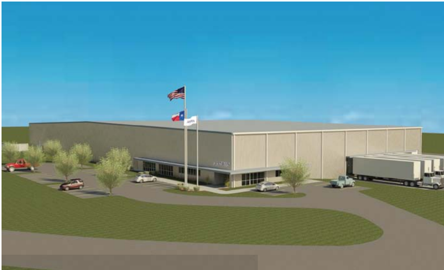
Reyes Amtex Automotive San Antonio, Texas