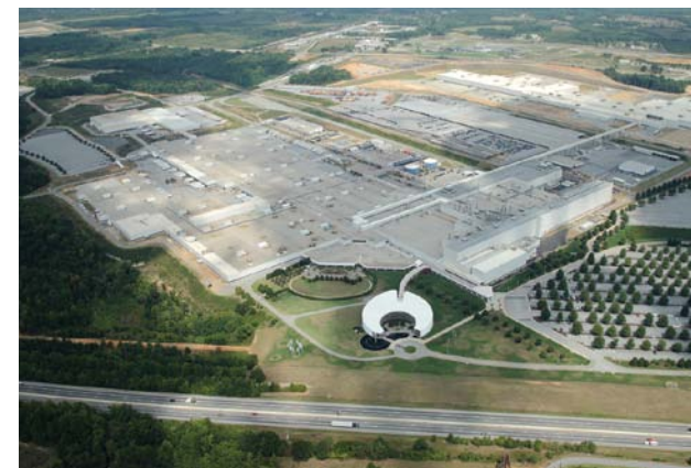
BMW Manufacturing Co., 1,150-acre campus in Greer, S.C.